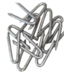
Cule Scoabe pentru lemn de