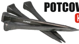
Calele pentru potcovit cai