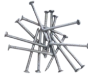
Cule tinte de