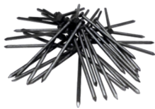
Cule pentru lemn de