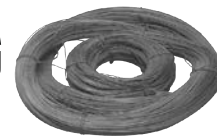
Sarma pentru legat fier beton