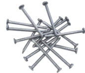
Cule pentru sita de