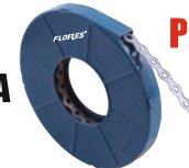
Banda metalica perforata