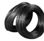
Sarma pentru cofrag