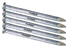
Cule pentru beton de