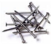
Cule pentru tapitarie de