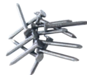
Cule pentru tabla de