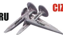
Cule pentru cizmarie de