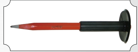
Spit pentru beton