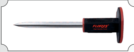
Spit pentru beton profesional