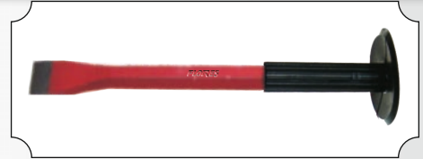
Dalta pentru beton