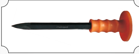
Spit pentru beton cu maner cauciuc