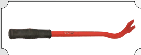
Ranga pentru cuie cu maner