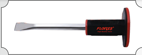
Dalta pentru beton profesionala